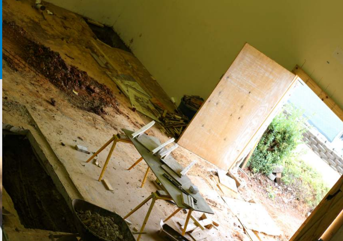
Area being demolished for the new Pro Shop, Front Desk and Teen Lounge, and Elevator shaft